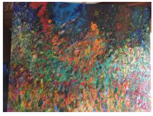
Passion Reef 60" X 48"