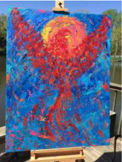
Flight of the Phoenix 48" x 36"

selection and look even further into the mind and heart of the artist, as well