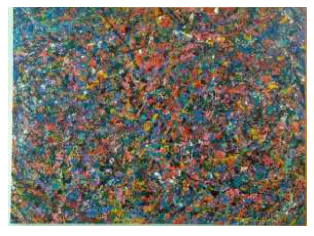
Tahiti 36" x 48"