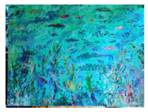
Vitamin Sea 48" x 60"