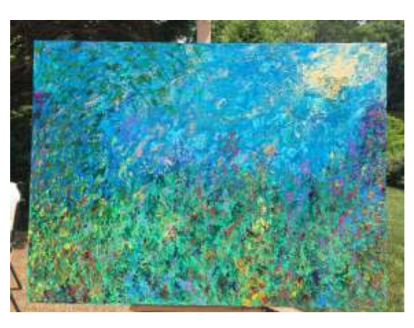
The Glade (The Glade Where Achilles Went to Ponder Immortality)36" x 48"