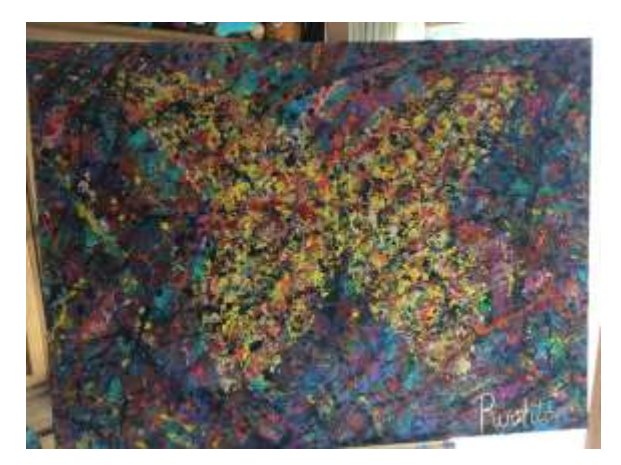
Butterfly 36" x 48"