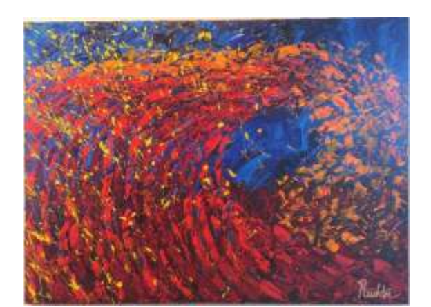
Heatwave 36" x 48"